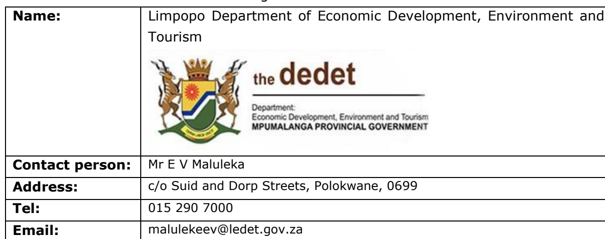
Table 2.4: Details of the commenting authorities – LDEDET

The Limpopo Department of Economic Development, Environment and Tourism (LDEDET) will act as a commenting authority for this application.