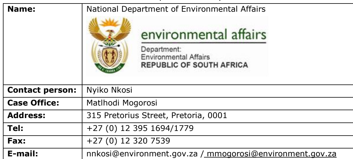
Table 2.3: Details of the relevant competent authority – DEA

The National Department of Environmental Affairs (DEA) will act as the competent authority and the LDEDET as the commenting authority for this application. The mandate and core business of DEA is underpinned by the Constitution and all other relevant legislation and policies applicable to the government.