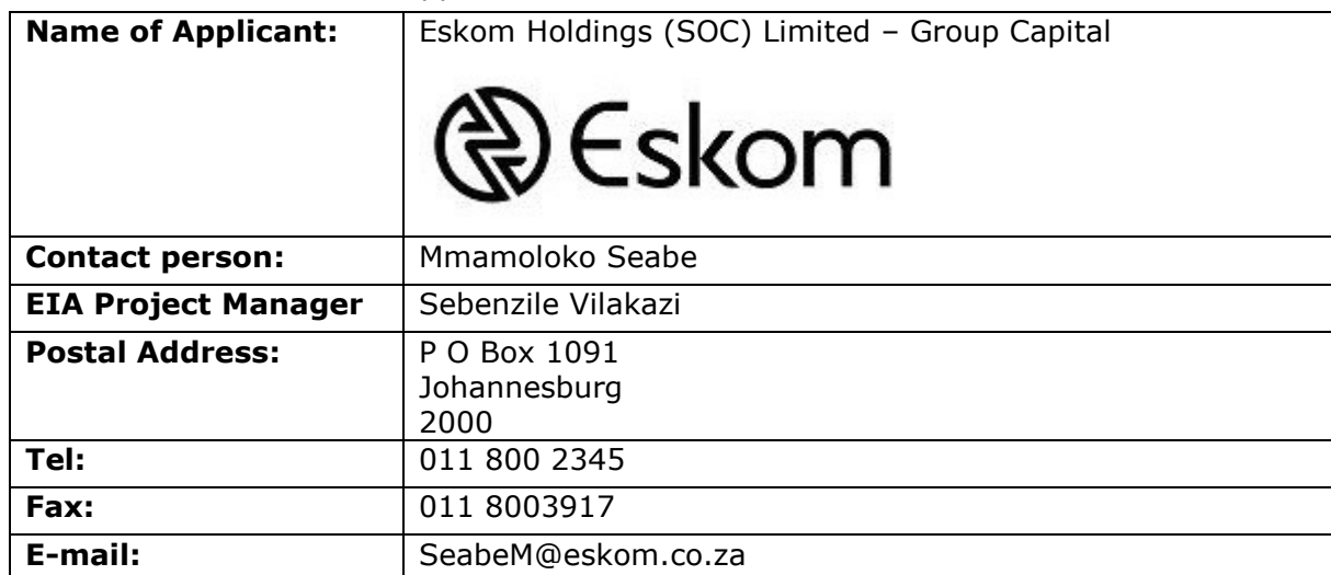
Table 2.1: Details of the applicant

The details of the applicant are shown in Table 2.1 below.